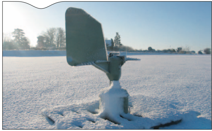
Figure 2. Volumetric spore trap (Burkard) in an experimental plot of wheat at INRA, Grignon, during the early winter phase of a septoria leaf blotch epidemic.

Most of the considerations and issues raised by the CROP BIOTERROR project have been taken up nationally, some being