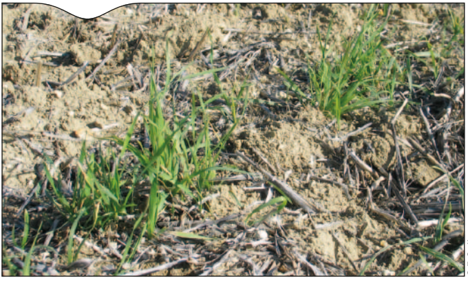
Figure 3. Wheat debris and volunteers in a field during the autumn.